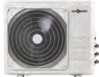
HCKU 601 Z3 HCKU 761 Z3