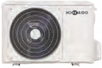
HCKU 471 Z2 HCKU 531 Z2

Outdoor unit - Up to 4 connectable indoor units