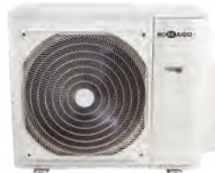
HCKU 810 Z4 HCKU 1060 Z4

A++/A+ (6.15~7.91 kW) | Energy efficiency class in cooling/heating